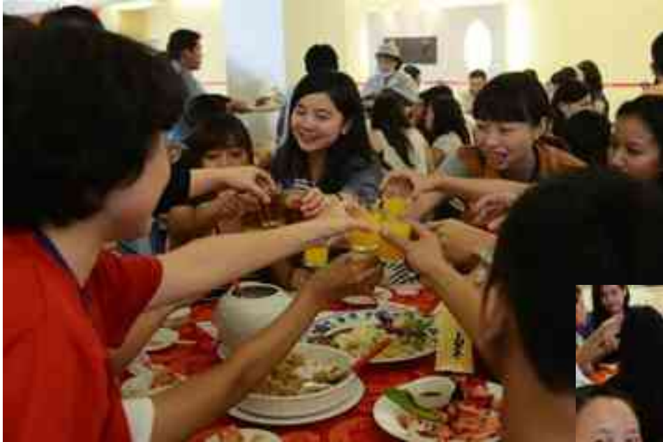
Taiwanese banquet (Ban-dou) in open-air