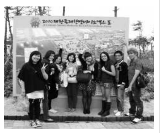
⊙Going out with friends!